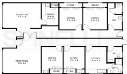
Shop 1&2, 109-111 Wentworth Street, Port Kembla Internal Size: 180m 2